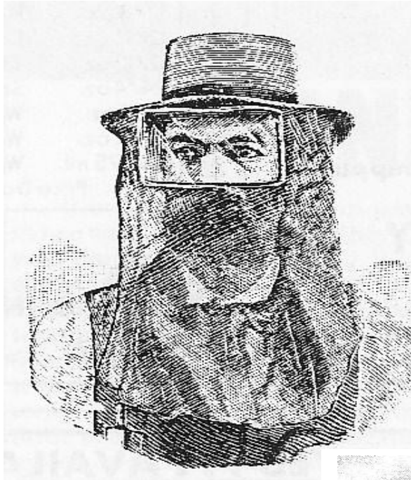
Left One style tried glass in the Veil to make visibility easier

Some early examples of that vital piece of equipment, the veil.