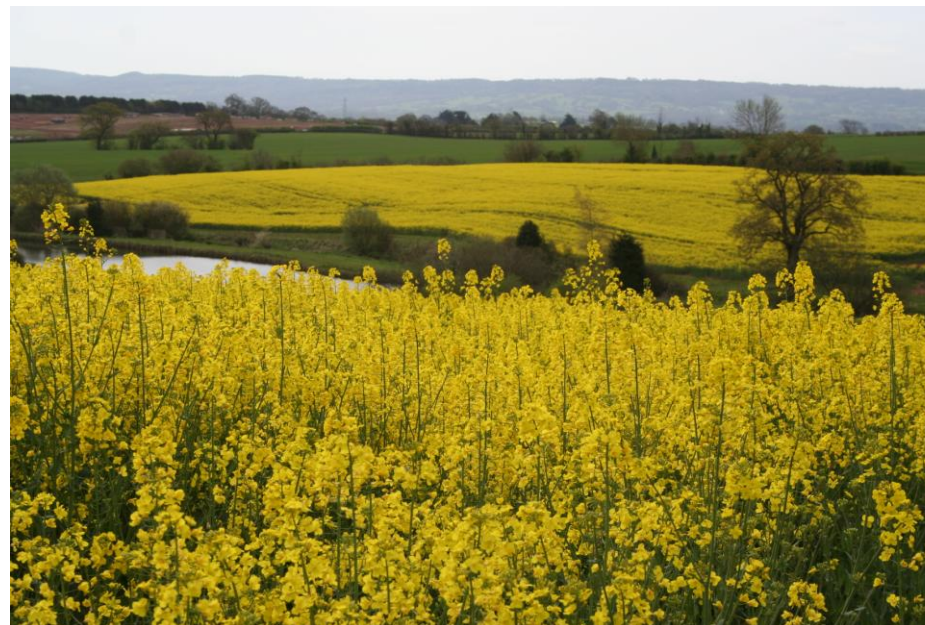
Oil Seed Rape growing in Halse