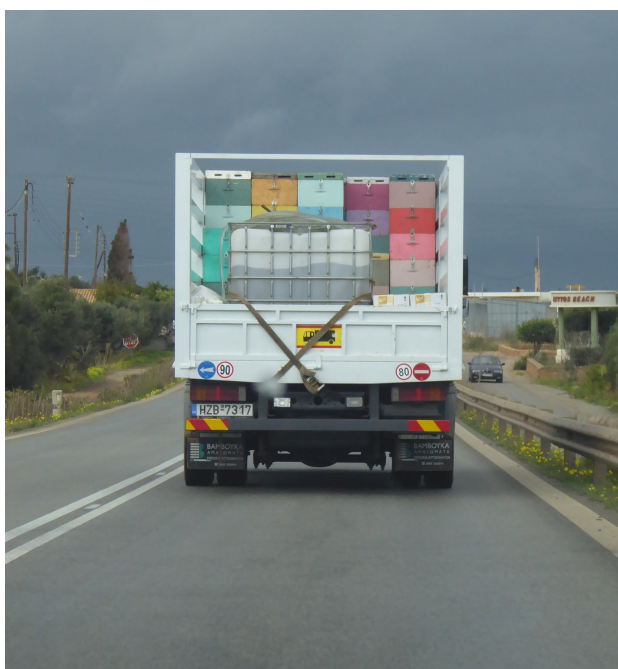
Bees on the move