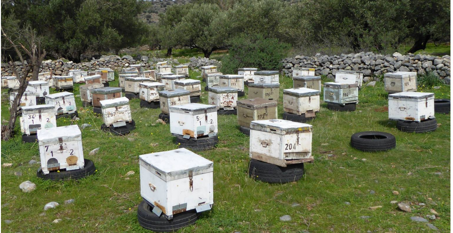
One of the Apiaries: Note the two entrances on some of them (they must be nukes)