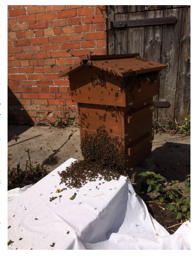
Swarm running into my Warre hive